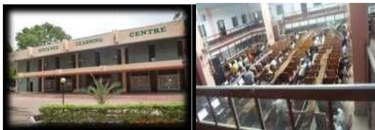
Frontage and Interior view of the Distance Learning Centre

The Distance Learning Centre of the Ahmadu Bello University (see pictures) is currently located in the Ahmadu Coomassie Building (former ABU Bookshop) adjacent the Senate Building on the Main Campus.