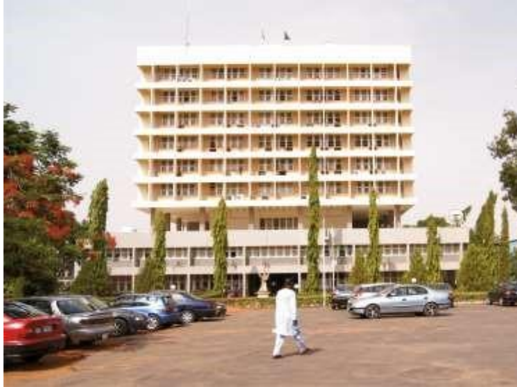
The University Senate building